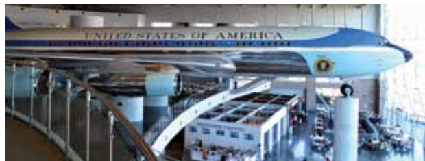
Air Force One

Membership Social at Santa Barbara Maritime Museum.