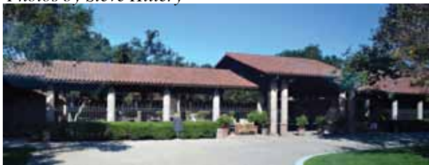
Entrance to Reagan Presidential Library & Museum